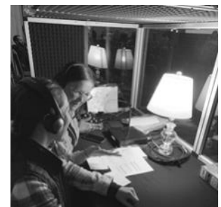
Sisters interpreting the WOH Conference into Spanish

events. Contact us if you'd like more information info@ironrosesister.com