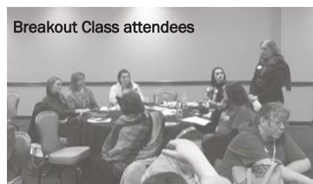
Breakout Class attendees