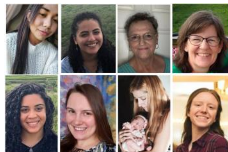
Find the HIStories of these ladies at IronRoseSister.com , under "Blog."

Additionally, when women are equipped to dig deeper into the Word, they are encouraged by the big picture story of the Bible, as well as empowered to recognize God's living and active hand at work today.