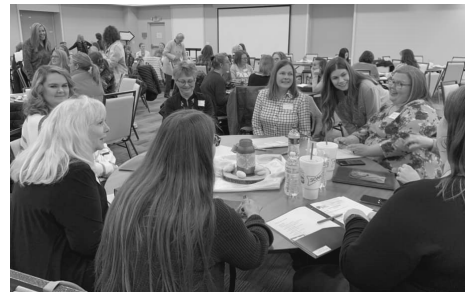
Women grow in their relationship with God and one another through small groups

eyes on "The Final Destination." There were 135 women in attendance! It was a great time for the women of that congregation to reconnect and for 24 new members and guests to meet other Christian women. Five women from a nearby drug recovery program came and were able to find new community in Christ.