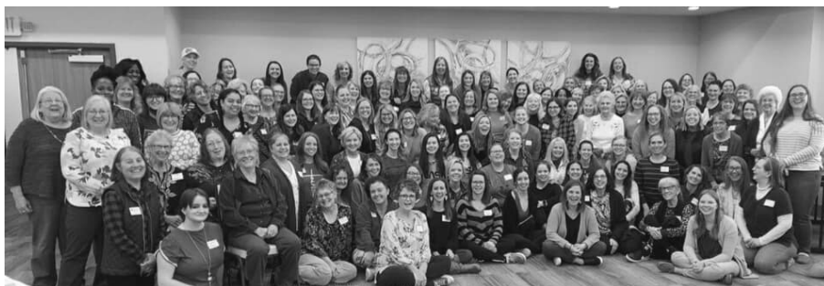
135 women participated in the Bentonville CoC Ladies' Retreat, AR

If you are interested in having us speak at your next ladies' day or retreat, you can learn more at ironrosesister.com/resources/seminars , and then email us at info@ironrosesister.com .