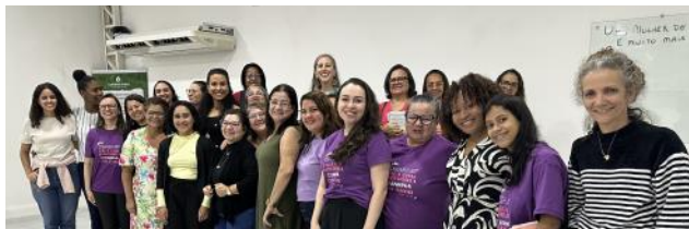
Ladies at our class at Seminário Teológico EBNSER, Recife, Brazil

To God be the glory as we strive to help women grow closer to God and one another!