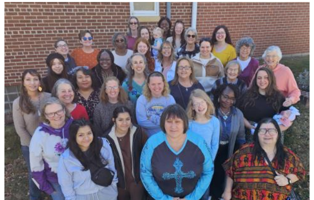
Some of the attendees of the "Committed to Christ" workshop - Rochester CoC - October 26, 2024

Forty ladies from two congregations in the Twin Cities gathered for the weekend workshop hosted by the Rochester Church of Christ in Minnesota.